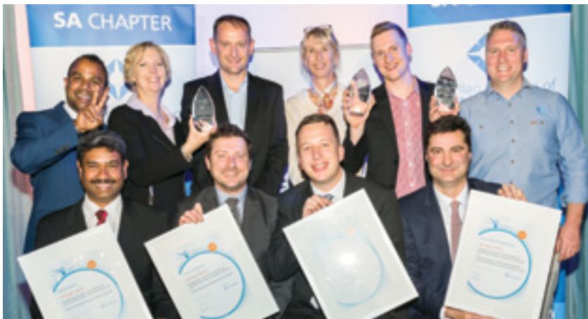
South Australian Project of the Year: KBR & SA Water JV Project Team

This project was originally intended to upgrade two wastewater pump stations in the Gawler region to accommodate population growth. An innovative design solution improved the overall wastewater network capacity by installing a new main with a cross connection to the original main. This provided greater network flexibility and negated the need for major upgrade works at one of the pump stations. Whilst the design was cost effective, the selected route had many stakeholder engagement and construction complexities. The project was completed under budget and ahead of schedule by a team of KBR and SA Water employees known as PMP Solutions.