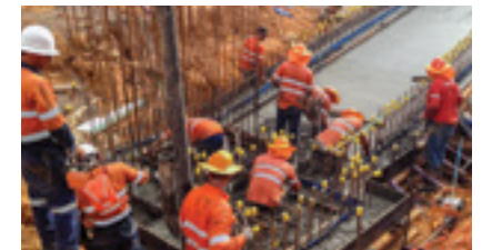
Regional Projects: Power and Water Corporation

Measuring Project Delivery Success Bond University