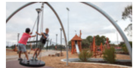
Sustainable Projects: The City of Gosnell