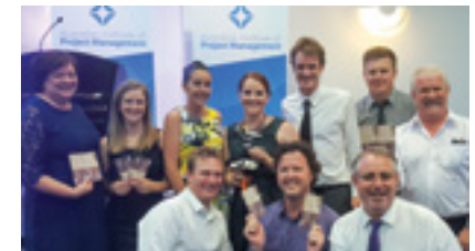
Table 9 winners of AECOM's Lego building competition