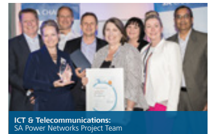
ICT & Telecommunications: SA Power Networks Project Team