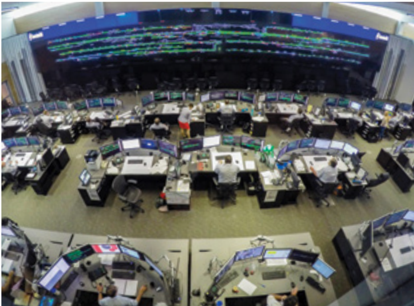
National Project of the Year: Queensland Rail Management Centre (RMC)

Included in the delivery of the facility were the design and construction of; telecommunications, operational engineer systems, security access control and CCTV, information technology systems and new operational procedures.